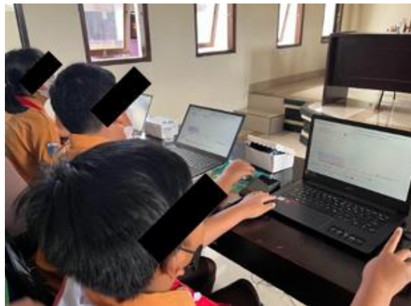
Figure 2. Students Accessing Virtual Exhibition

In summary, the limited trials and field test involved introducing the RME media, conducting classroom activities, receiving guidance from the mathematics teacher, and assessing students' performance to determine how well the media supported their learning. These steps allowed researchers to refine the media and assess its impact on a smaller and larger scale, respectively.