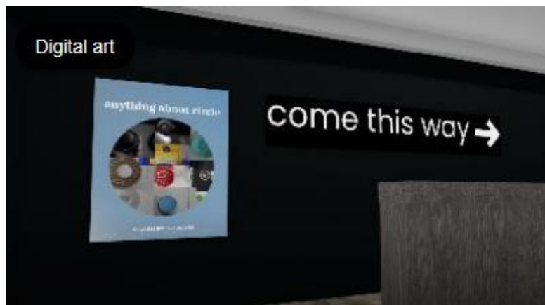
Figure 1. Virtual Exhibition on Circle Material